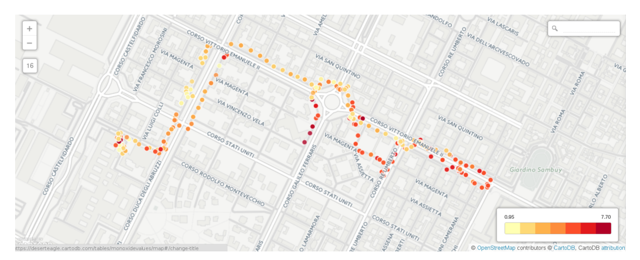
Figure 3: Values are in parts per million

Regarding the Carbon Monoxide acquired data, given the fact that the sensor does not need calibration, it was possible to estimate the gas concentration straightaway. The gathered data were perfectly plausible and compatible with the expected carbon monoxide concentration in a city like Turin, ranging on average from 1 to 10 ppm (see figure 3 for an example). Unfortunately, it was not possible to cross-validate the acquired data with high accuracy sensors, because such a professional instrumentation was not available at TIM. To remedy this flaw, an experimentation will be done in the next months in collaboration with ARPA Piemonte to permit a stricter validation of the gathered pollution data. SwarmBike has also been selected by TIM for an experimentation in quartiere Campidoglio, in the context of the "Torino Living Lab" project, an initiative launched by the Torino city council.