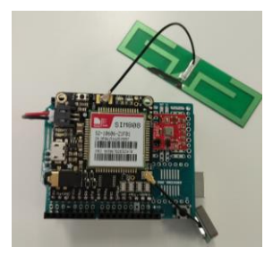
Figure 1: Location & temp system

The process of development of the device was carried out in a differentiate way, that is to say by implementing successively the different modules thus working on Arduino platform as it was considered the most suitable platform.