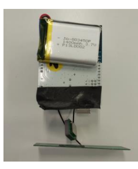
Figure 2: Back view

Considering the objectives that are described along the first part of this document, it can be stated that the development of the project is considered greatly satisfactory since it is observed that the initial limitations detected are implemented by means of the prototype designed by this project. It has been accomplished a tele-assistance service that provides user's covering so much inside his home as much as outside it by means of using GPRS technology. The current dimensions of the prototype are approximately the same as the ones of a tobacco individual box so this characteristic makes it easy to insert the device in the users' daily life in a more simple way when comparing it with the base station. Finally, I would like to highlight that by means of the connection with a data platform it has been able to verify as the system implemented by this project allows the addition of new elements and components of IoT environment.