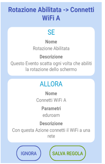
Figure 2: details of a rule

asks the user if the association has to be saved or ignored. In the first case the application sends a